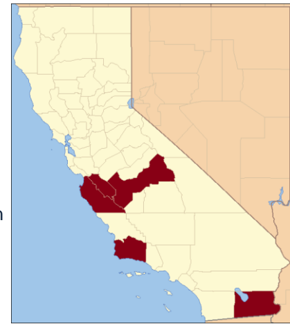
Figure 2: Location of the five leading lettuce producing counties in California [13] .

In 2007, 57% of the lettuce produced in California came from fields in Monterey County, where lettuce is harvested from spring to fall. During the winter months, lettuce is predominantly produced in Imperial County, which accounted for 13% of the lettuce production in California in 2007 [13] . Therefore, these two counties together produce 70% of California's the lettuce, which corresponds to more than half of the lettuce produced in the U.S. With a share of roughly 5% each of the total production, San Benito, Santa Barbara, and Fresno Counties are other important lettuce producing counties (Figure 2) [13] .